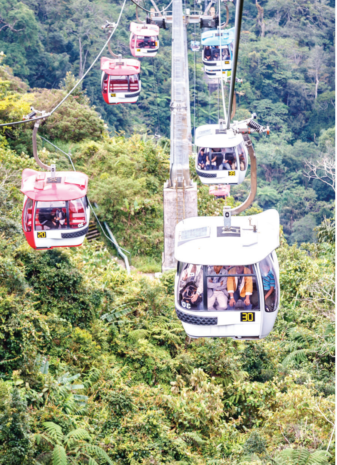
Tourists travel on cable car in Malaysia. It is a gondola lift, connecting Gohitong Jaya and Resorts World Genting.