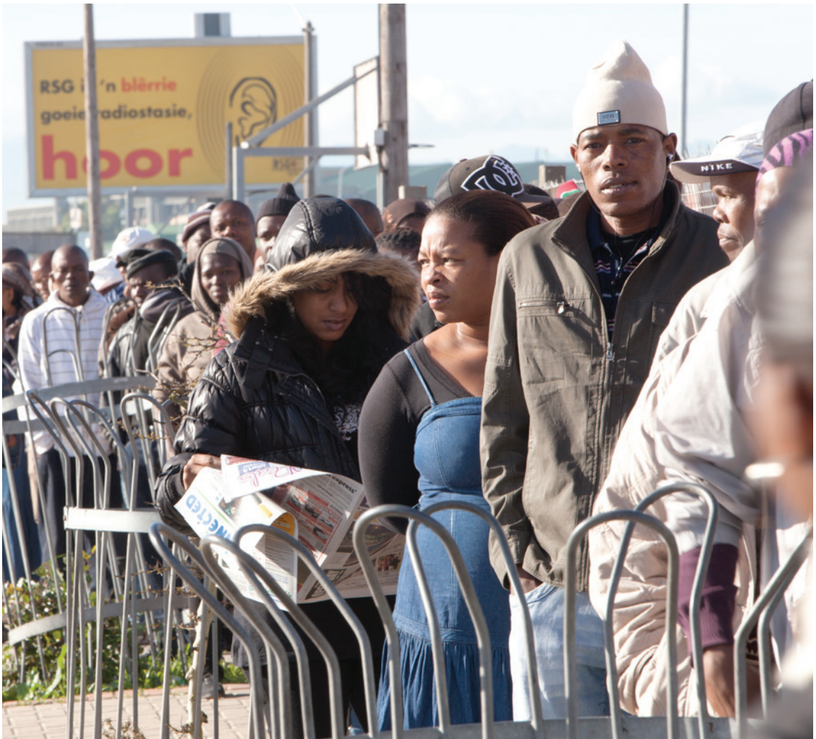
Voters gather at the polling booths during the municipal elections, in Cape Town, South Africa.

There is not enough empirical evidence to draw definitive conclusions, but there are some clear indications both that citizens are willing to pay local government revenues if they perceive that they are being treated fairly and receiving some benefit from local government expenditure, and that local government efforts to enforce tax compliance do not go unnoticed by their constituents and can be productive if they are reasonably structured and seen as impartially administered. More generally, the evidence reinforces the potential political and fiscal value of better informing and engaging citizens regarding the generation and use of local government revenues.