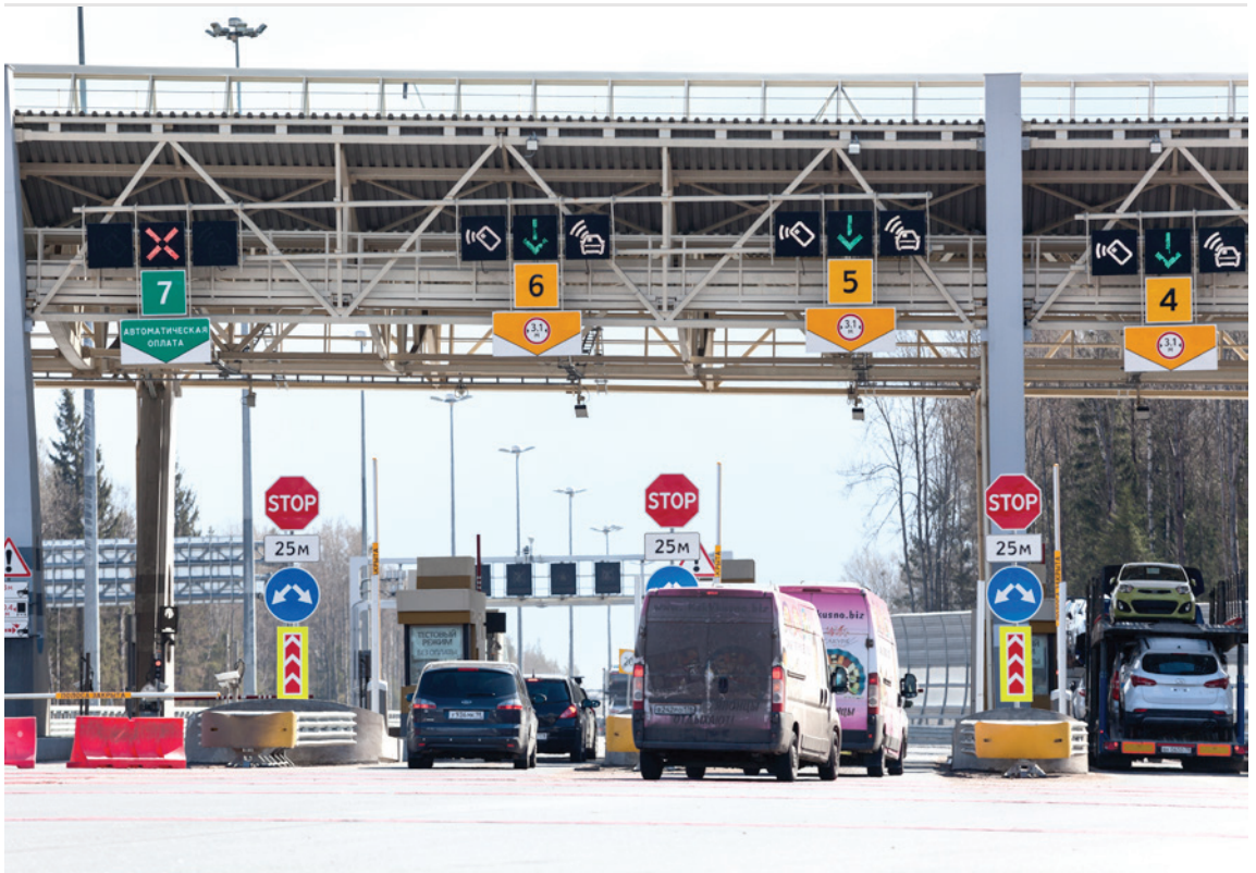
Fee booths in Western High-Speed Diameter (WHSD) tollway. The route to Scandinavia