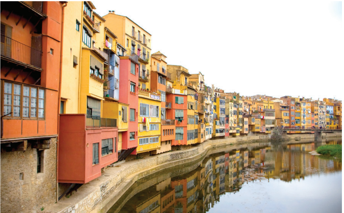
Girona, Spain

How do we ultimately rank the different choices of subnational taxes discussed above? The answer depends greatly on how we score each tax on a long list of desirable properties such as revenue potential, ability to fit the benefit principle, non-exportability, and so on. 24 Still, it is safe to say that a good and productive tax structure at the local level would have a basket of many, if not all, the instruments we reviewed above as good choices; starting with a substantial role for fees and charges, and with property taxes and piggyback personal income taxes also playing major revenue roles.